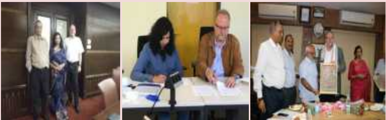
Proposed MOU with IIM, Ranchi (TBC)