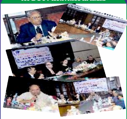
News & Views towards Cooperation for DGUV Activities in India