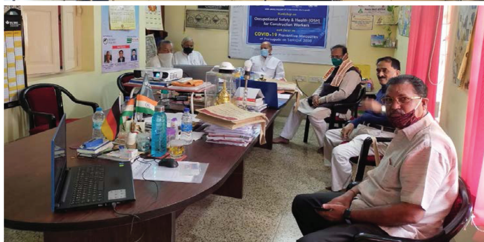
Participants of the Workshop on OSH for construction workers with a focus on COVID-19 preventive measures at Jharsuguda and Bhubaneswar, Odisha