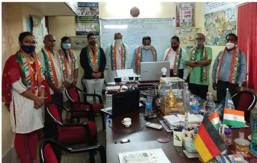
Launch of the e-publications website of the IGFP on India's Independence Day 2020 at the office of the IGFP at Bhubaneswar